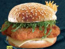
برجر افضاخ دجاج CHI. THIGHS BURGER DHS. 12.00