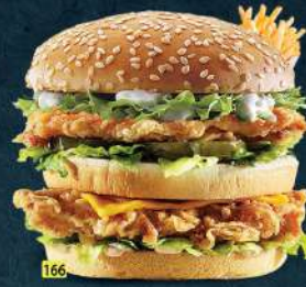
زنجر عملاق MEGA ZINKER DHS. 15.00