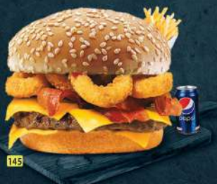
برجر لحم بقر مشوي خاص SP. GR. BEEF BURGER DHS. 17.00