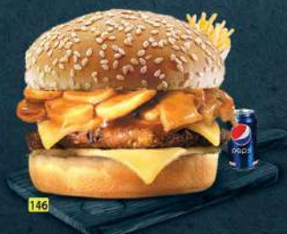
برجر دجاج مشوي روم GR. CHI. MUSHROOM BURGER DHS. 16.00