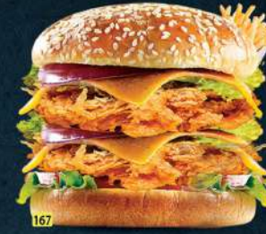
ميكسي خاص MICY SPECIAL DHS. 16.00