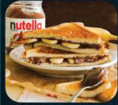
نوتيللا مع موز NUTELLA W. BANANA DHS. 8.00 373

BREAKFAST IS THE FIRST MEAL OF THE DAY EATEN AFTER WAKING FROM THE NIGHT'S SLEEP, IN THE MORNING THE WORD IN ENGLISH REFERS TO BREAKING THE FASTING PERIOD OF THE PREVIOUS NIGHT.