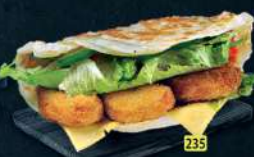
حمبور روبيان JUMBO PRAWNS DHS. 6.00