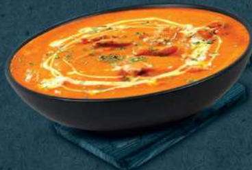
دجاج بالزبدة Butter Chicken DHS. 12/20 88