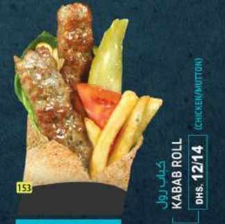
كباب رول KABAB ROLL DHS. 12/14 (CHICKEN/MUTTON)