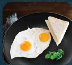
بيض نصف مقلي EGG HALF FRY DHS. 8.00 379