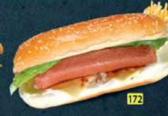
نقانق عملاق MEGA HOTDOG DHS. 12.00