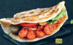
براتا روبيان PRAWNS PORATTA DHS. 6.00