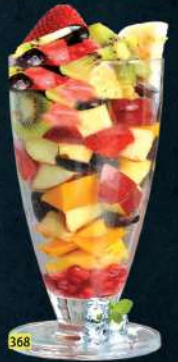
فواكه مشكل MIX FRUIT DHS. 14.00