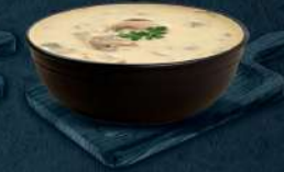
كريمة مشروم CREAM OF MUSHROOM DHS. 13.00 94