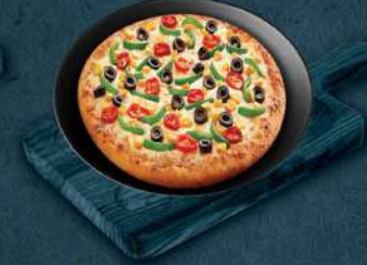
بيتزا خضار VEGETABLE PIZZA DHS. 20/30 113