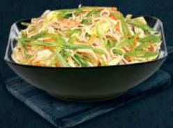
معكرونة مشكل MIX NOODLES DHS. 20.00 43