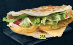
براتا دجاج بالليمون CHI. LEMON PORATTA DHS. 6.00