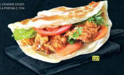
براتا زنجير ZINKER PORATTA DHS. 10.00