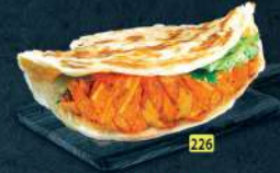
براتا فرانسيسكو FRANSISCO PORATTA DHS. 6.00