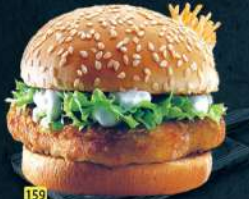
برجر خليج KHALEEJ BURGER DHS. 12.00