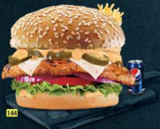
برجر دجاج جلابينو مشوي GR. JALAPINO CHI. BURGER DHS. 16.00