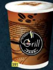
بوست / هورليكس BOOST/ HORLICKS DHS: 4/6