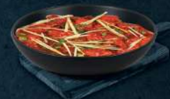
دجاج بالزنجبيل GINGER CHICKEN DHS. 12/18 60