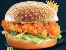
برجر زنجر ZINKER BURGER DHS. 12.00