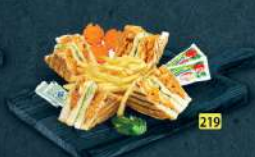
كلوب ايطالي ITALIAN CLUB DHS. 14.00