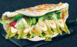
براتا بيض EGG PORATTA DHS. 4.00