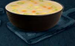
شورية دجاج و ذرة حلوة SWEET CORN CHI. SOUP DHS. 12.00 91