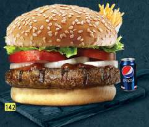
برجر لحم بقر مشوي كبير BIG BEEF GR. BURGER DHS. 16.00