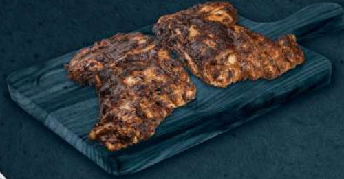
دجاج بالفلفل على الفحم PEPPER CHICKEN CHARCOAL 02 DHS. 22/40