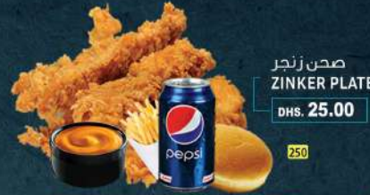
صحن زنجر ZINKER PLATE DHS. 25.00