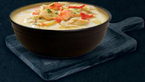
شورية كريمية مأكولات بحرية Seafood Cream Soup DHS. 18.00 92

SOUP IS A PRIMARILY LIQUID FOOD, GENERALLY SERVED WARM (BUT MAY BE COOL OR COLD), THAT IS MADE BY COMBINING INGREDIENTS SUCH AS MEAT AND VEGETABLES WITH STOCK, JUICE, WATER, OR ANOTHER LIQUID. HOT SOUPS ARE ADDITIONALLY CHARACTERIZED BY BOILING SOLID INGREDIENTS IN LIQUIDS IN A POT UNTIL THE FLAVORS ARE EXTRACTED, FORMING A BROTH.