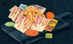
كلوب عملاق MEGA CLUB DHS. 15.00