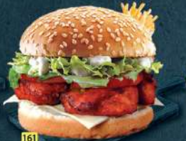
برجر دجاج تندور CHI. TANDOOR BURGER DHS. 12.00