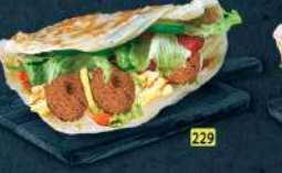
براتا فلافل FALAFEL PORATTA DHS. 4.00