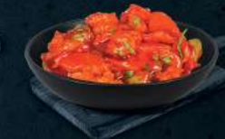
روبيان منشوريان PRAWNS MANCHURIAN DHS. 12/20 65