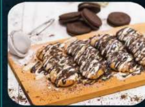
بان كيك اوريو OREO PANCAKE DHS. 15.00 396