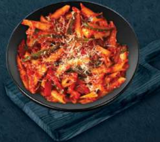
باستا بيني صوص احمر PENNE PINK PASTA DHS. 28.00 122