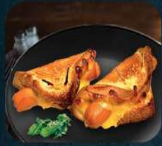
سيمي نقانق SEMI HOTDOG DHS. 8.00 374