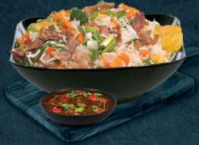
ارز مقلي مشكل مع دجاج منشوريان MIX FRIED RICE WITH CHICKEN MANCHURIAN DHS. 22.00 69