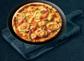
بيتزا مأكولات بحرية SEAFOOD PIZZA DHS. 22/32 111