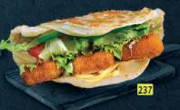
براتا قطع NUGGETS PORATTA DHS. 6.00