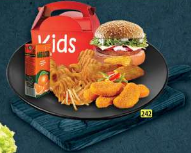
وجبة الأطفال KIDS MEAL DHS. 20.00