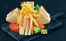
كلوب رويال ROYAL CLUB DHS. 14.00