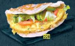
براتا اومليت OMELETTE PORATTA DHS. 4.00