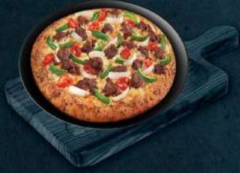
بيتزا سوبر لحم بقر SUPER BEEF PIZZA DHS. 20/30 114