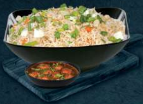
ارز مقلي خضار مع خضار منشوريان VEG. FRIED RICE WITH VEG. MANCHURIAN DHS. 18.00 68