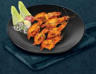
روبيان مشوي GRILLED PRAWNS 14 DHS. S/R