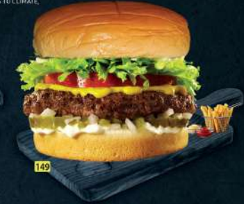
شاي اليوم برجر خاص SHAY AL YOUM SP. BURGER DHS. 25.00 (CHI./BEEF)