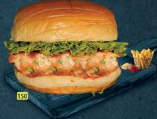
برجر ديناميت DYNAMITE BURGER DHS. 20/22 (CHI./PRAWNS)