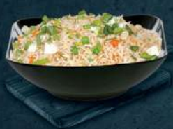
ارز مقلي خضار VEG. FRIED RICE DHS. 13.00 40