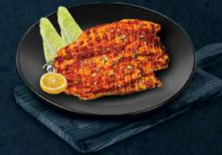
فيليه هامور HAMOUR FILLET 13 DHS. 25.00