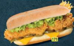
كومبو مطافي MATHAFI COMBO DHS. 15.00