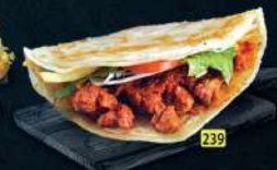
براتا ناشيف NASHIF PORATTA DHS. 6.00