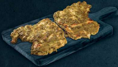
دجاج بالفلفل الأخضر الحار على الفحم GREEN CHILLI CHICKEN CHARCOAL 03 DHS. 22/40