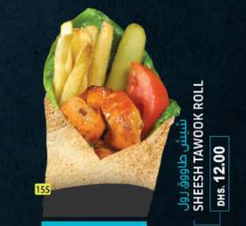
شيش طاووق رول SHEESH TAWOOK ROLL DHS. 12.00