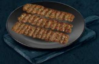
كباب (دجاج/ لحم ضان) KABAB (CHICKEN/MUTTON) 05 DHS. 28.00