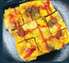
افطار بيض EGG BREAKFAST DHS. 6.00 376