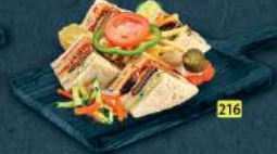
كلوب لحم بقري BEEF CLUB DHS. 14.00