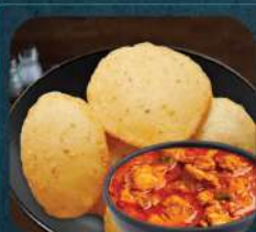
ني باتال + صالونة دجاج NEYPATHAL + CHI. CURRY DHS. 7.00 383