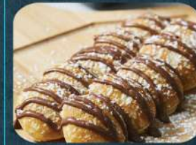
بان كيك نوتيللا NUTELLA PANCAKE DHS. 15.00 394