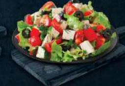
سلطة يونانية GREEK SALAD DHS. 18.00 107