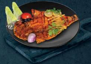
هامور / شيري مشوي GRILLED SHERRY / HAMOUR 12 DHS. S/R