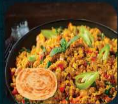
بيض برنجي مع براتا EGG BHURJI W. PORATTA DHS. 8.00 377