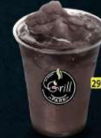
سلاش توت مشكل MIXBERRY SLUSH DHS. 10.00