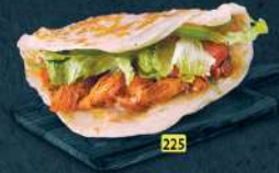
براتا دجاج بالقلقل الحار CHI. CHILLI PORATTA DHS. 5.00

A SANDWICH IS A FOOD TYPICALLY CONSISTING OF VEGETABLES, SLICED CHEESE OR MEAT, PLACED ON OR BETWEEN SLICES OF BREAD, OR MORE GENERALLY ANY DISH WHEREIN BREAD SERVES AS A CONTAINER OR WRAPPER FOR ANOTHER FOOD TYPE [1][2][3] THE SANDWICH BEGAN AS A PORTABLE, CONVENIENT FINGER FOOD IN THE WESTERN WORLD, THOUGH OVER TIME IT HAS BECOME PREVALENT WORLDWIDE.