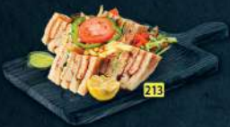
كلوب دجاج CHICKEN CLUB DHS. 14.00