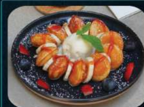
بان كيك ايس كريم مشكل ICE CREAM MIX PANCAKE DHS. 15.00 399