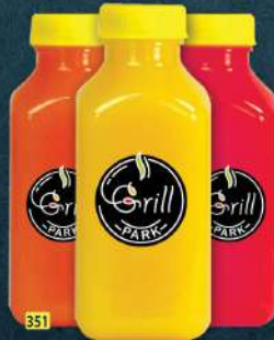
عصير غرشة BOTTLE JUICE DHS. 30.00