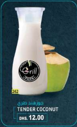
جوزهند طري TENDER COCONUT DHS. 12.00