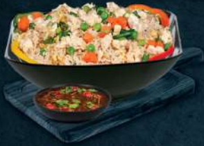
ارز مقلي دجاج مع دجاج منشوريان CHICKEN FRIED RICE WITH CHICKEN MANCHURIAN DHS. 19.00 67

CHINESE CUISINE INCLUDES STYLES ORIGINATING FROM THE DIVERSE REGIONS OF CHINA, AS WELL AS FROM CHINESE PEOPLE IN OTHER PARTS OF THE WORLD. THE HISTORY OF CHINESE CUISINE IN CHINA STRETCHES BACK FOR THOUSANDS OF YEARS AND HAS CHANGED FROM PERIOD TO PERIOD AND IN EACH REGION ACCORDING TO CLIMATE, IMPERIAL FASHIONS, AND LOCAL PREFERENCES.