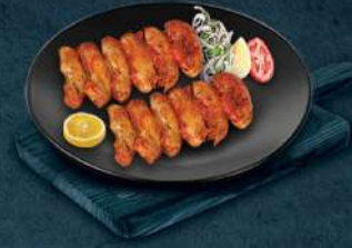
أجنحة دجاج CHICKEN WINGS 08 DHS. 20.00

BARBECUE CHICKEN CONSISTS OF CHICKEN PARTS OR ENTIRE CHICKENS THAT ARE BARBECUED, GRILLED OR SMOKED THERE ARE MANY GLOBAL AND REGIONAL PREPARATION TECHNIQUES AND COOKING STYLES.