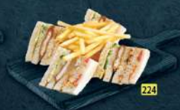
كلوب لولو LULU CLUB DHS. 14.00