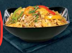
معكرونة بيض EGG NOODLE DHS. 13.00 45