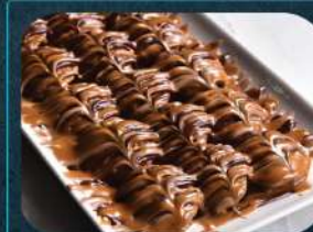
بان كيك كيندر KINDER PANCAKE DHS. 15.00 397