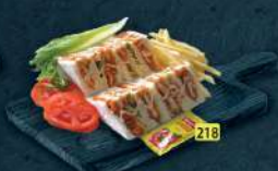
كلوب كلزوني CALZONI CLUB DHS. 14.00