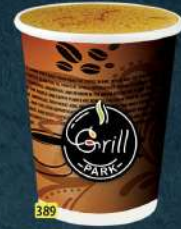
كرك زعفران KARAK ZAFRAN DHS: 2/4

TEA IS AN AROMATIC BEVERAGE PREPARED BY POURING HOT OR BOILING WATER OVER CURED OR FRESH LEAVES OF CAMELLIA SINENSIS, AN EVERGREEN SHRUB NATIVE TO CHINA AS WELL AS OTHER EAST AND SOUTHEAST ASIAN COUNTRIES. AFTER WATER, IT IS THE MOST WIDELY CONSUMED DRINK IN THE WORLD.