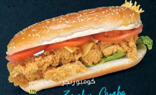
كومبو زنجر Zinker Combo DHS. 12.00