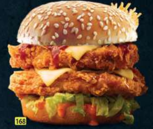
برجر ماك دبل MAC DOUBLE BURGER DHS. 16.00