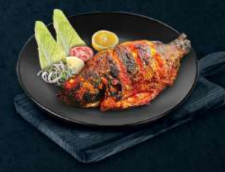
بلطي مشوي GRILLED TILAPIA 16 DHS. S/R