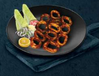
نغر مشوي GRILLED SQUID 15 DHS. 28.00