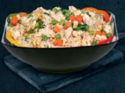
ارز مقلي دجاج / لحم بقري CHI./ BEEF FRIED RICE DHS. 15.00 39