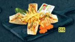
كلوب رولكس ROLEX CLUB DHS. 14.00