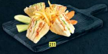
كلوب زنجير ZINKER CLUB DHS. 14.00