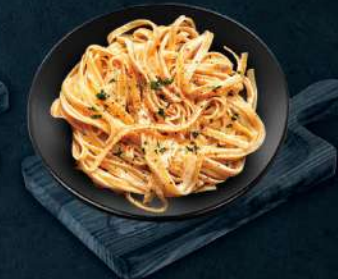
باستا فيتوتشيني FETTUCCINE PASTA DHS. 30.00 121