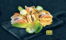
كلوب كباب KABAB CLUB DHS. 14.00 (CHI/MUTTON)