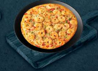
بيتزا اروبجان SHRIMPS PIZZA DHS. 22/32 116