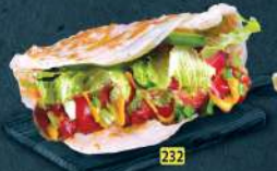
براتا نقانق HOTDOG PORATTA DHS. 5.00