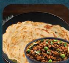
براتا + قيمية PORATTA + KEEMA DHS. 7.00 384