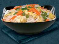
ارز مقلي بيض EGG FRIED RICE DHS. 13.00 42