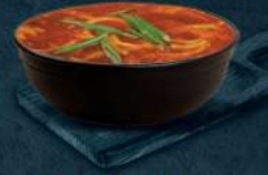
شورية حار و حامض HOT & SOUR SOUP DHS. 12.00 90