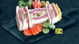
كلوب نقانق HOTDOG CLUB DHS. 14.00