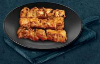
شيش طاووق SHEESH TAWOOK 07 DHS. 26.00