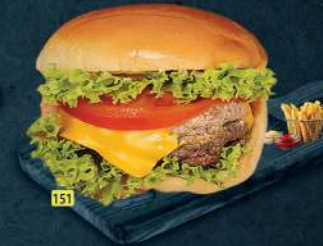
جريل بارك برجر طازج خاص GRILL PARK SP. FRESH BURGER DHS. 22/24 (CHI./BEEF)