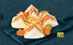
كلوب اسباني SPANISH CLUB DHS. 14.00