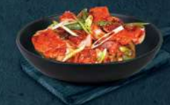
سمك بالفلفل الحار FISH CHILLY DHS. 12/18 63