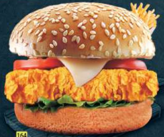
فانتاسي الدجاج زينج بعيب FANTASY ESCALOPE DHS. 13.00