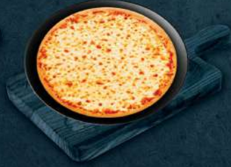
جبنة مارغايثا CHEESE MARGAITHA DHS. 20/30 115