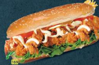
كومبو كلزوني CALZONI COMBO DHS. 12.00

A SANDWICH IS A FOOD TYPICALLY CONSISTING OF VEGETABLES, SLICED CHEESE OR MEAT PLACED ON OR BEFORE BEING KNOWN AS SANDWICHES, THIS FOOD COMBINATION SEEMS TO SIMPLY HAVE BEEN KNOWN AS "BREAD AND MEAT" OR "BREAD AND CHEESE".