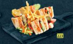
كلوب مأكولات بحرية SEAFOOD CLUB DHS. 16.00