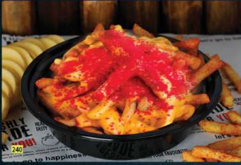
بطاطا بجن الشيدر و الشيتوس CHEDDAR CHIPS WITH CHEETOS