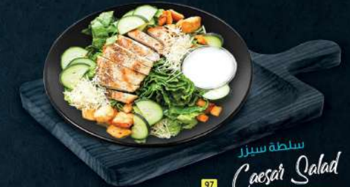
سلطة سيزر Caesar Salad DHS. 20.00 97

A SALAD IS A DISH CONSISTING OF MIXED, MOSTLY NATURAL INGREDIENTS WITH AT LEAST ONE RAW INGREDIENT. THEY ARE OFTEN DRESSED, AND TYPICALLY SERVED AT ROOM TEMPERATURE OR CHILLED, THOUGH SOME CAN BE SERVED WARM.