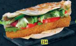
براتا فيليه FILLET PORATTA DHS. 7.00