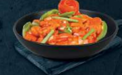
روبيان بالفلفل الحار CHILLY PRAWNS DHS. 12/20 64