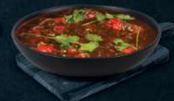
دجاج منشوريان CHI. MANCHURIAN DHS. 12/18 61