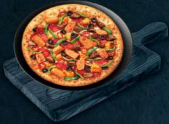
بيتزا هوتداغ HOTDOG PIZZA DHS. 20/30 109

PIZZA IS A SAVORY DISH OF ITALIAN ORIGIN CONSISTING OF A USUALLY ROUND, FLATTENED BASE OF LEAVENED WHEAT-BASED DOUGH TOPPED WITH TOMATOES, CHEESE, AND OFTEN VARIOUS OTHER INGREDIENTS WHICH IS THEN BAKED AT A HIGH TEMPERATURE, TRADITIONALLY IN A WOOD-FIRED OVEN. A SMALL PIZZA IS SOMETIMES CALLED A PIZZETTA.