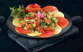
سلطة عربية ARABIC SALAD DHS. 15.00 108