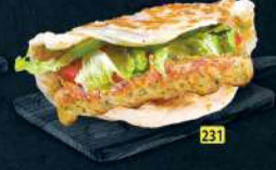
براتا كباب KABAB PORATTA DHS. 6.00