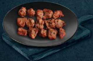
تكا لحم ضان MUTTON TIKKA 06 DHS. 28.00