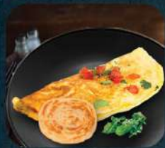
اومليت مع براتا OMELETTE W. PORATTA DHS. 8.00 378