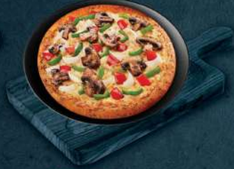
بيتزا مشروم MUSHROOM PIZZA DHS. 20/30 112