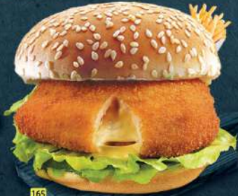
برجر فيليه دجاج بالجبن Chi. Fillet Cheesy Burger DHS. 13.00