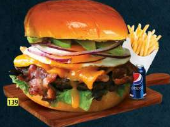
جريل بارك برجر افوكادو خاص GRILL PARAK SP. AVOCADO BURGER DHS. 22.00

A GRILLED SANDWICH IS A HOT SANDWICH MADE WITH ONE OR MORE GRILLED PATTIES OF MEAT OR CHEESE ON BREAD. IT IS TYPICALLY PREPARED BY HEATING CHEESE BETWEEN SLICES OF BREAD, WITH A COOKING FAT SUCH AS BUTTER, ON A FRYING PAN, GRIDDLE, OR SANDWICH TOASTER, UNTIL THE BREAD BROWNS AND THE CHEESE MELTS.