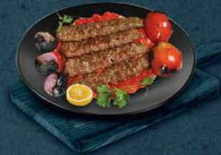
كباب كاش كاش KISH KASH KABAB 11 DHS. 30.00