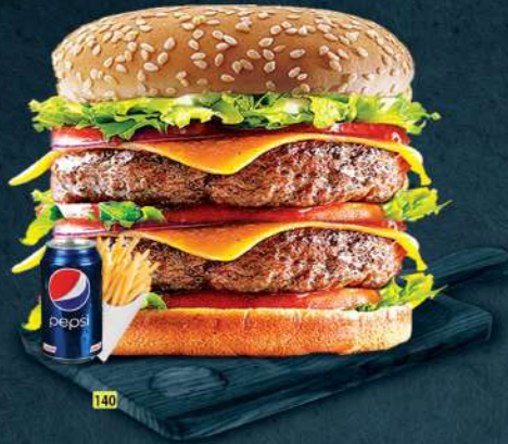
جريل بارك برجر مشوي خاص GRILL PARAK SP. GRILLED BURGER DHS. 21.00