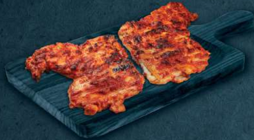
دجاج حراق على الفحم SPICY CHICKEN CHARCOAL 04 DHS. 22/40