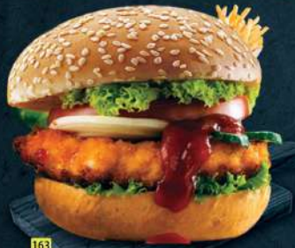
برجر فيليه دراغون Dragon Fillet Burger DHS. 13.00