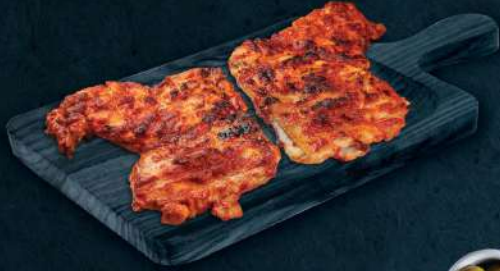
دجاج تركي على الفحم TURKISH CHICKEN CHARCOAL 01 DHS. 22/40

BARBECUE CHICKEN CONSISTS OF CHICKEN PARTS OR ENTIRE CHICKENS THAT ARE BARBECUED, GRILLED OR SMOKED THERE ARE MANY GLOBAL AND REGIONAL PREPARATION TECHNIQUES AND COOKING STYLES.