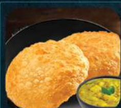
بورق باجي POORI BHAJI DHS. 6.00 381

BREAKFAST IS THE FIRST MEAL OF THE DAY EATEN AFTER WAKING FROM THE NIGHT'S SLEEP, IN THE MORNING THE WORD IN ENGLISH REFERS TO BREAKING THE FASTING PERIOD OF THE PREVIOUS NIGHT.