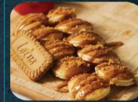
بان بكيك لوتس LOTUS PANCAKE DHS. 15.00 395