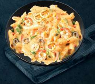
باستا مأكولات بحرية SEAFOOD PASTA DHS. 35.00 123