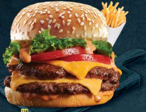
برجر بالجبن خاص Cheesy Burger Special DHS. 20.00 (CHICKEN / BEEF / VEG.)