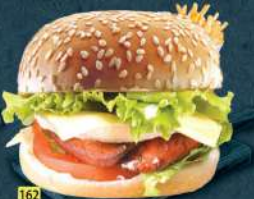
دجاج بيرق بيرق CHICKEN PERI PERI DHS. 12.00