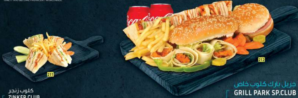
جريل بارك كلوب خاص GRILL PARK SP. CLUB DHS. 40.00

A SANDWICH IS A FOOD TYPICALLY CONSISTING OF VEGETABLES, SLICED CHEESE OR MEAT, PLACED ON OR BETWEEN SLICES OF BREAD, OR MORE GENERALLY ANY DISH WHEREIN BREAD SERVES AS A CONTAINER OR WRAPPER FOR ANOTHER FOOD TYPE [1][2][3] THE SANDWICH BEGAN AS A PORTABLE, CONVENIENT FINGER FOOD IN THE WESTERN WORLD, THOUGH OVER TIME IT HAS BECOME PREVALENT WORLDWIDE.