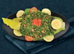
تبولة TABBOULEH DHS. 15.00 105