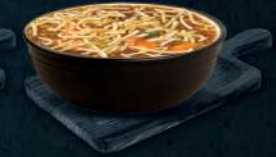
شورية مانشو MANCHOW SOUP DHS. 15.00 96