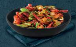
لحم بقري بالفلفل الحار CHILLY BEEF DHS. 12/18 62