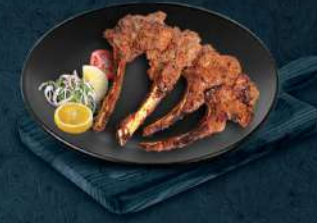
ريش LAMB CHOPS 09 DHS. 48.00