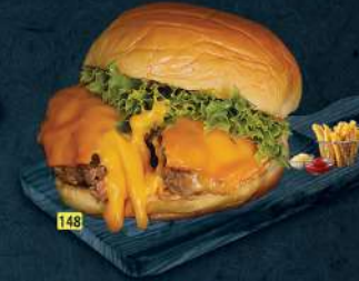
برجر طازج بالجبين FRESH CHEESY BURGER DHS. 22/24 (CHI./BEEF)