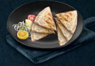
عرايس ARAYES 10 DHS. 26.00