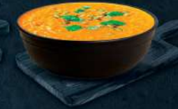
شورية عدس LENTIL SOUP DHS. 12.00 95