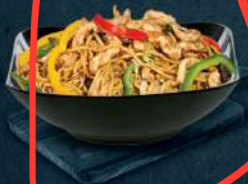
معكرونة دجاج CHICKEN NOODLES DHS. 15.00 44