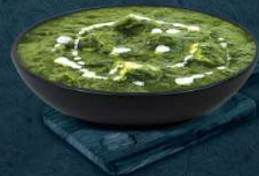
بالاك بانير PALAK PANEER DHS. 15.00 89