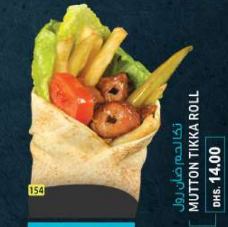
تخا لحم ضأن رول MUTTON TIKKA ROLL DHS. 14.00