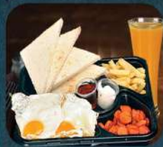
افطار انجليزي ENGLISH BREAKFAST DHS. 18.00 380