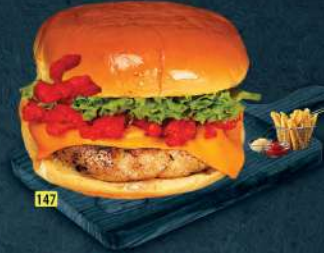
برجر طازج بالشييتوس FRESH CHEETOS BURGER DHS. 20/22 (CHI./BEEF)

CHINESE CUISINE INCLUDES STYLES ORIGINATING FROM THE DIVERSE REGIONS OF CHINA, AS WELL AS FROM CHINESE PEOPLE IN OTHER PARTS OF THE WORLD. THE HISTORY OF CHINESE CUISINE IN CHINA STRETCHES BACK FOR THOUSANDS OF YEARS AND HAS CHANGED FROM PERIOD TO PERIOD AND IN EACH REGION ACCORDING TO CLIMATE, IMPERIAL FASHIONS, AND LOCAL PREFERENCES.