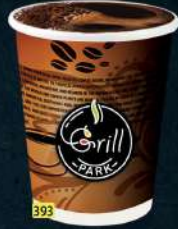
قهوة بالحليب COFFEE W. MILK DHS: 4/6