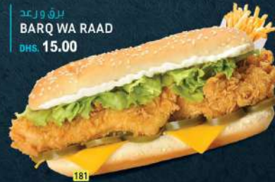
برق وراع BARQ WA RAAD DHS. 15.00