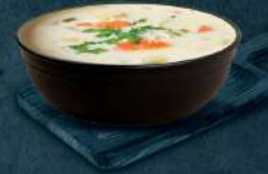
كريمة دجاج CREAM OF CHICKEN DHS. 15.00 93