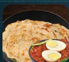
براتا + بيض مشوي PORATTA + EGG ROAST DHS. 7.00 382