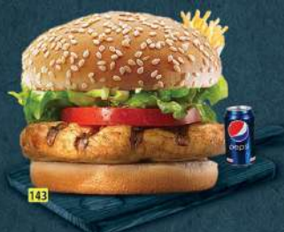
كومبو دجاج مشوي كبير BIG CHICKEN GR. COMBO DHS. 16.00