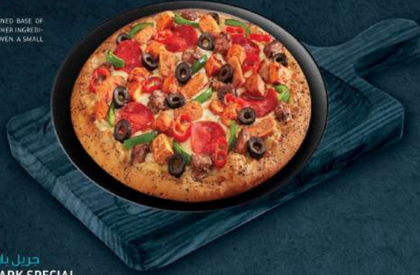
جريل بارك خاص GRILL PARK SPECIAL DHS. 25/35 110 BEEF, HOTDOG, PEPPERONI, MUSHROOM