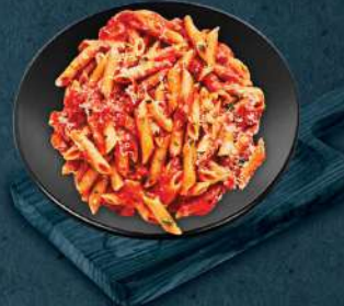
باستا بيني شيتوس PENNE CHEETOS PASTA DHS. 28.00 119