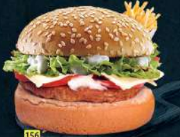
برجر دجاج CHICKEN BURGER DHS. 7.00 (CHICKEN / BEEF / VEG.)

A SANDWICH IS A FOOD TYPICALLY CONSISTING OF VEGETABLES, SLICED CHEESE OR MEAT, PLACED ON OR BEFORE BEING KNOWN AS SANDWICHES, THIS FOOD COMBINATION SEEMS TO SIMPLY HAVE BEEN KNOWN AS "BREAD AND MEAT" OR "BREAD AND CHEESE".