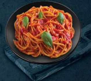
اسباغيتي بولونيز SPAGHETTI BOLOGNESE DHS. 30.00 120