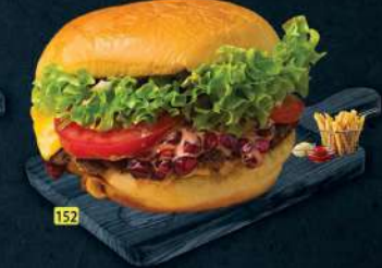
برجر طازج بالرومان FRESH RUMAN BURGER DHS. 20/22 (CHI./BEEF)