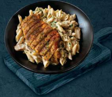
باستا بيني الفريديو PENNE ALFREDO PASTA DHS. 28.00 117

PASTA IS A TYPE OF FOOD TYPICALLY MADE FROM AN UNLEAVENED DOUGH OF WHEAT FLOUR MIXED WITH WATER OR EGGS, AND FORMED INTO SHEETS OR OTHER SHAPES, THEN COOKED BY BOILING OR BAKING.