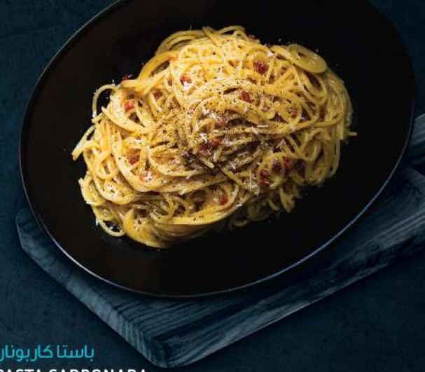
باستا كاربونارا PASTA CARBONARA DHS. 30.00 118