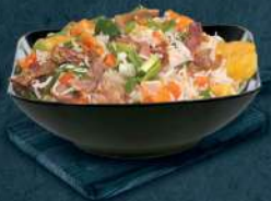
ارز مقلي مشكل MIX FRIED RICE DHS. 20.00 41