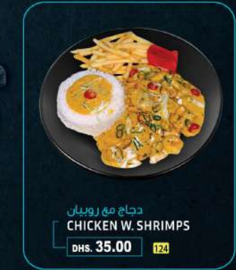
دجاج مع روبيان CHICKEN W. SHRIMPS DHS. 35.00 124