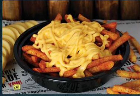
بطاطا مقلية بالجبن CHEESY FRIES (SPICY/NORMAL)