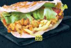
براتا تيككا TIKKA PORATTA DHS. 6.00