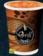
حليب طازج بزعفران FRESH MILK ZAFRAN DHS: 4/6