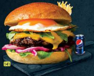
شاي اليوم برجر مشوي SHAY AL YOUM GR. BURGER DHS. 17.00