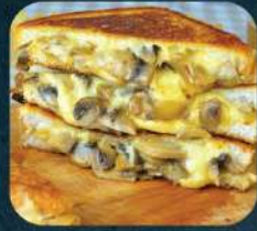
مشروم مع بيض MUSHROOM W. EGG DHS. 6.00 375