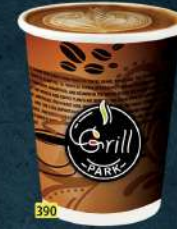
كابيتشينو CAPPUCCINO DHS: 4/6