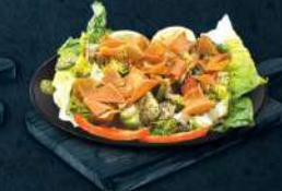
فتوش FATTOUSH DHS. 15.00 106