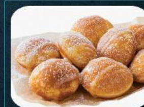
بان كيك عسل HONEY PANCAKE DHS. 15.00 398