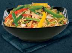
معكرونة خضار VEG. NOODLES DHS. 13.00 46